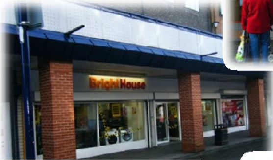
Bright House Your Weekly Payment Store