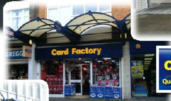
Card Factory Quality cards at discount prices